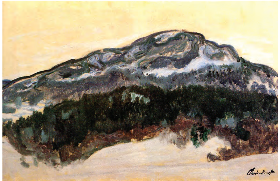
By Claude Monet.