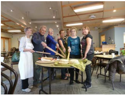
Lompe for Syttende Mai