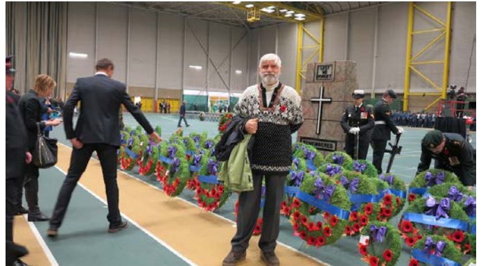
Remembrance Day – Nov. 11 th .

Two Solglyt members are lucky enough to have seating on the main floor where ‘Sons of Norway’ is announced.